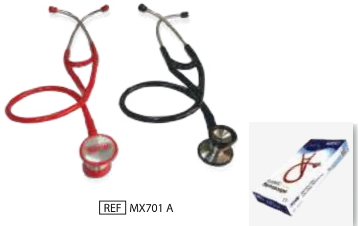
REF MX701 A