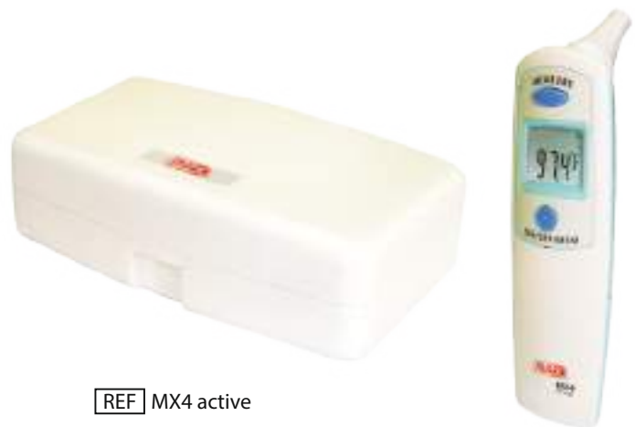
REF MX4 active