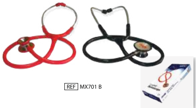
REF MX701 B